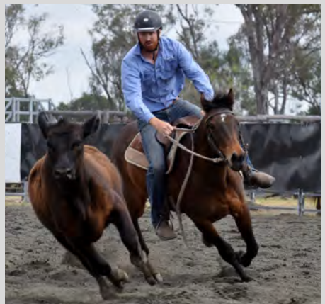
CONDAMINE & CHINCHILLA TRIP 2022